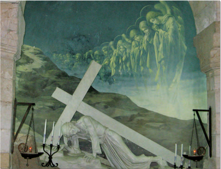
Station III – Jesus Falls the First Time Polish Catholic Chapel, Via Dolorosa, Jerusalem