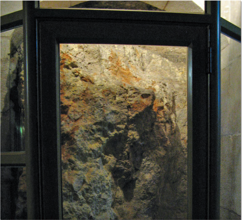
Stone of Mount Calvary Church of the Holy Sepulchre, Jerusalem