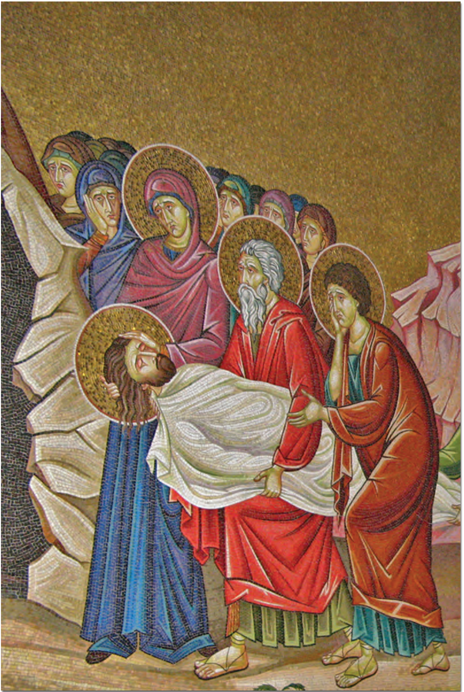
Mural of the Deposition and Anointing of Christ Church of the Holy Sepulchre, Jerusalem