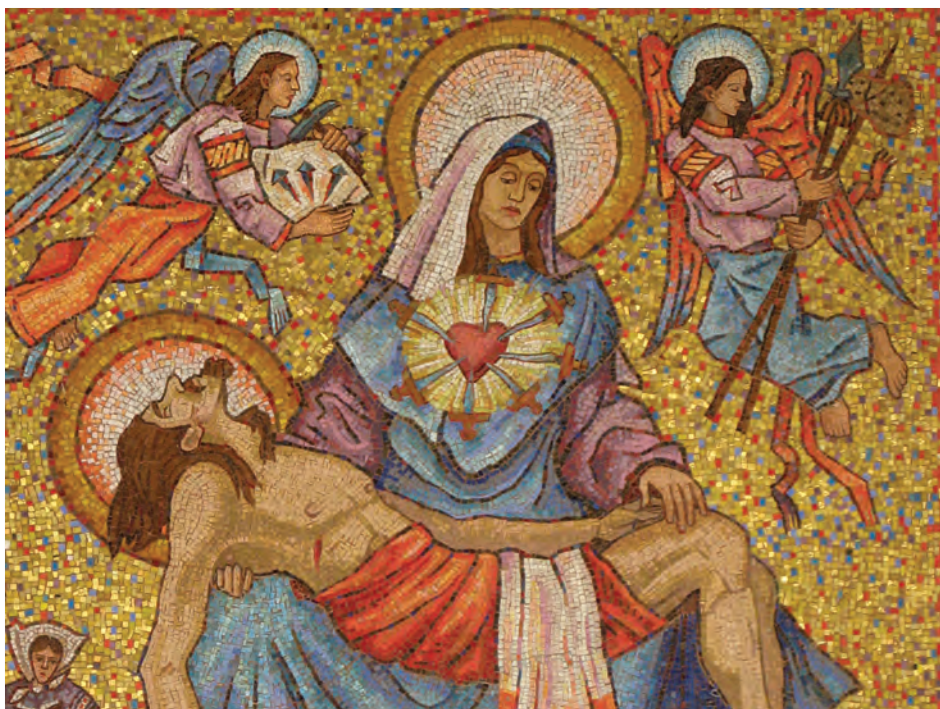
"Sorrowful Virgin, Patron of Slovakia, Come to Our Aid." Mosaic from Slovak Republic Basilica of the Annunciation, Nazareth