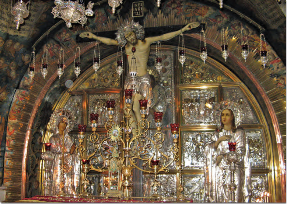
Altar at the Site of the Crucifixion Mount Calvary Church of the Holy Sepulchre, Jerusalem

[H]e emptied himself, / taking the form of a slave, / coming in human likeness; / and found human in appearance, / he humbled himself, / becoming obedient to death, / even death on a cross. Phil 2:7-8