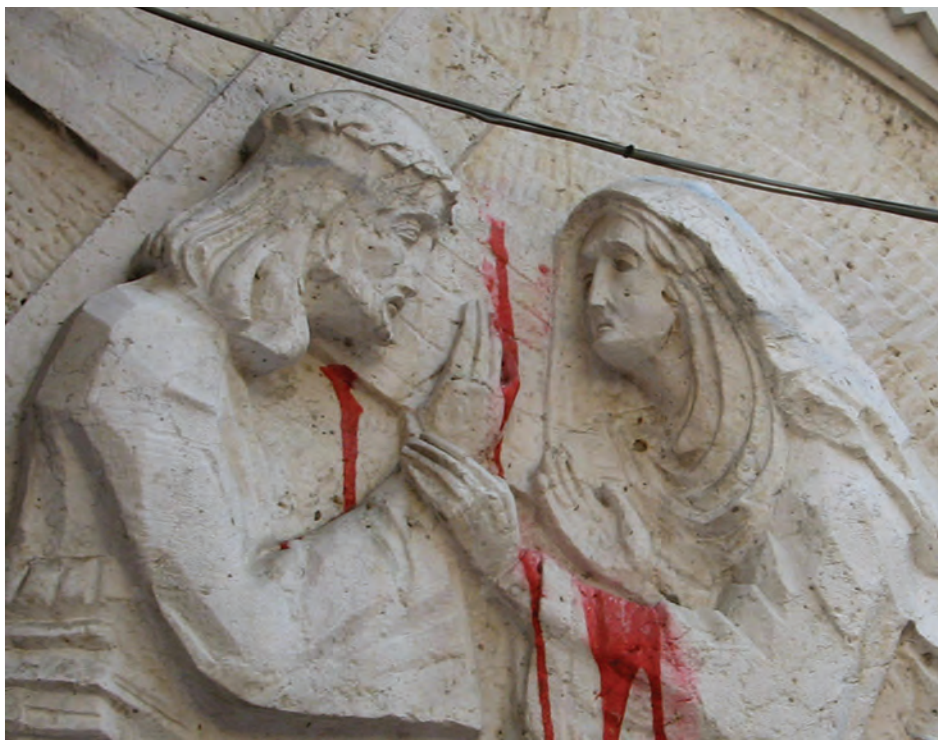
Station IV – Jesus meets Mary His Mother Via Dolorosa, Jerusalem