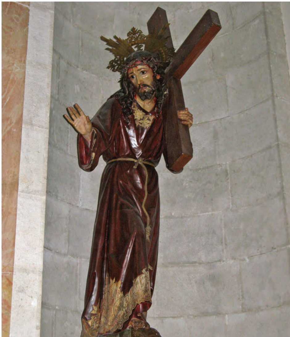
Church of the Condemnation and Imposition of the Cross Jerusalem