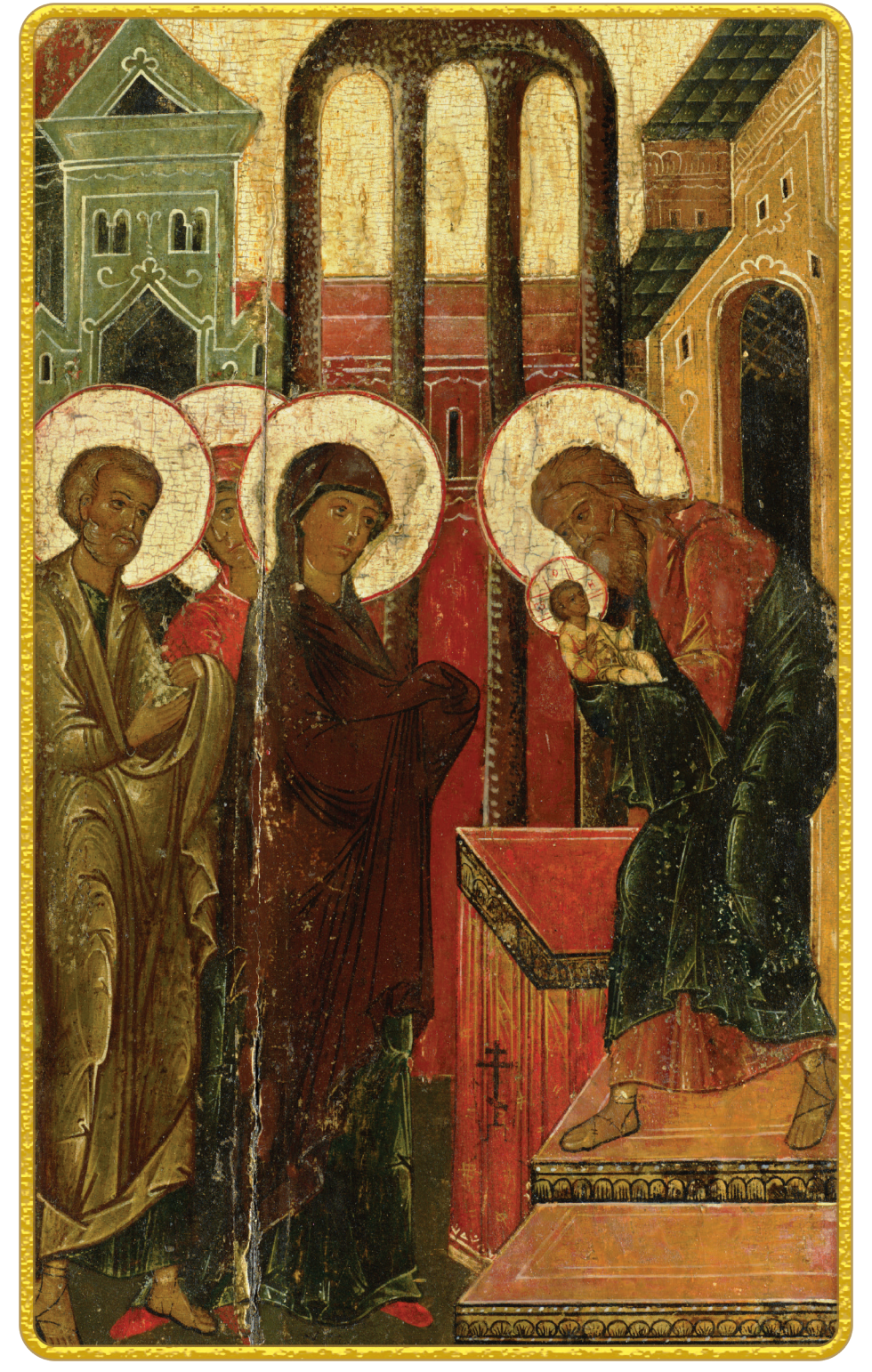
Presentation of Christ in the Temple (R2007.32)