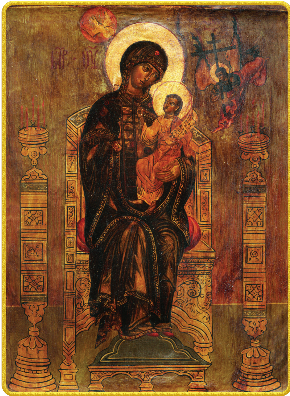
Mother of God Enthroned (R1999.4)