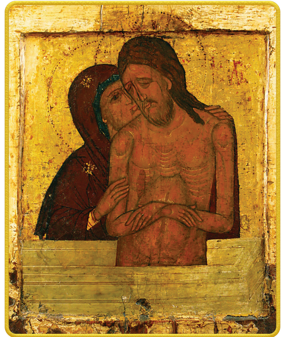
Don't Cry for Me Mother of God (R2010.14)