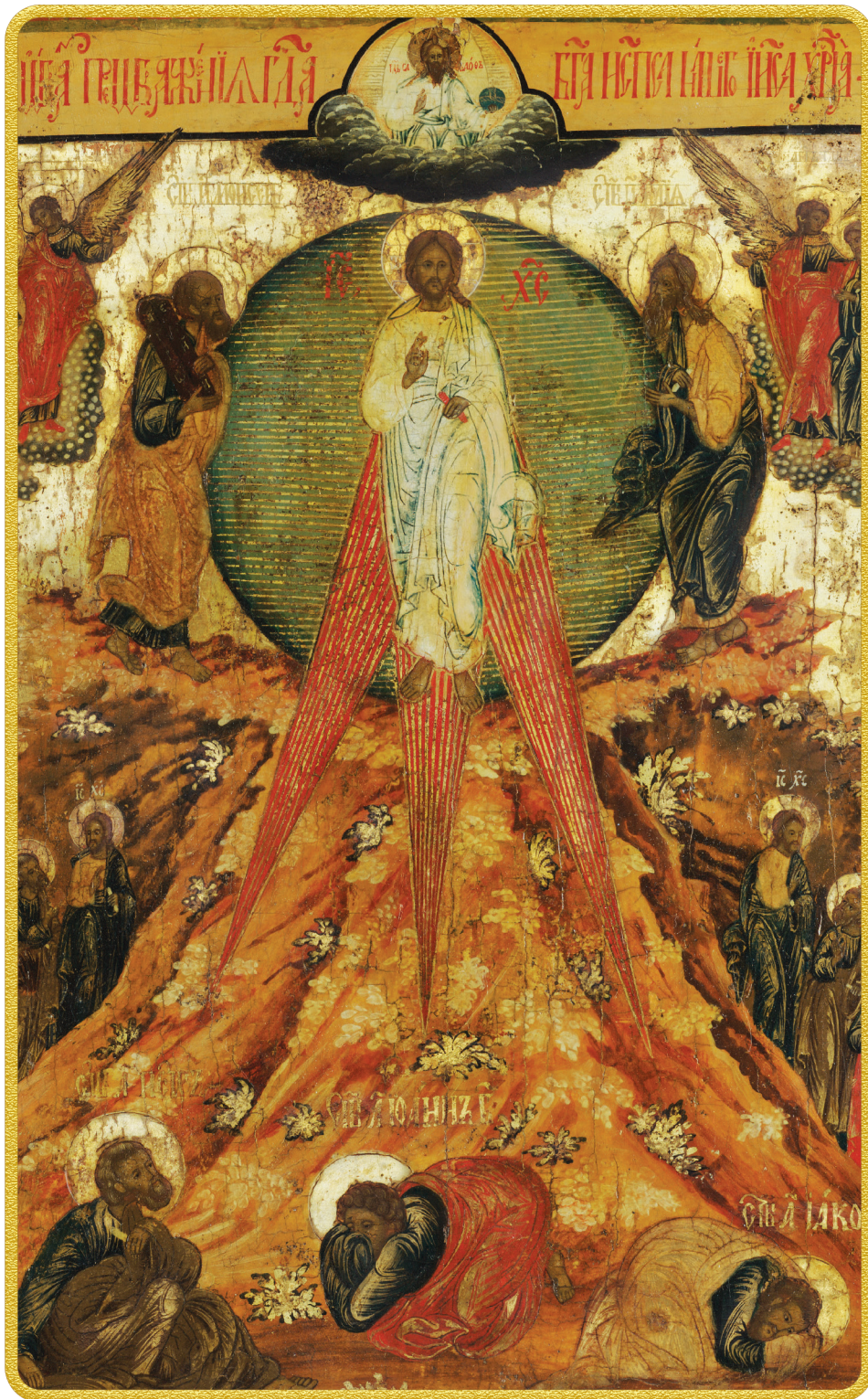
The Transfiguration of Christ (R2003.26)